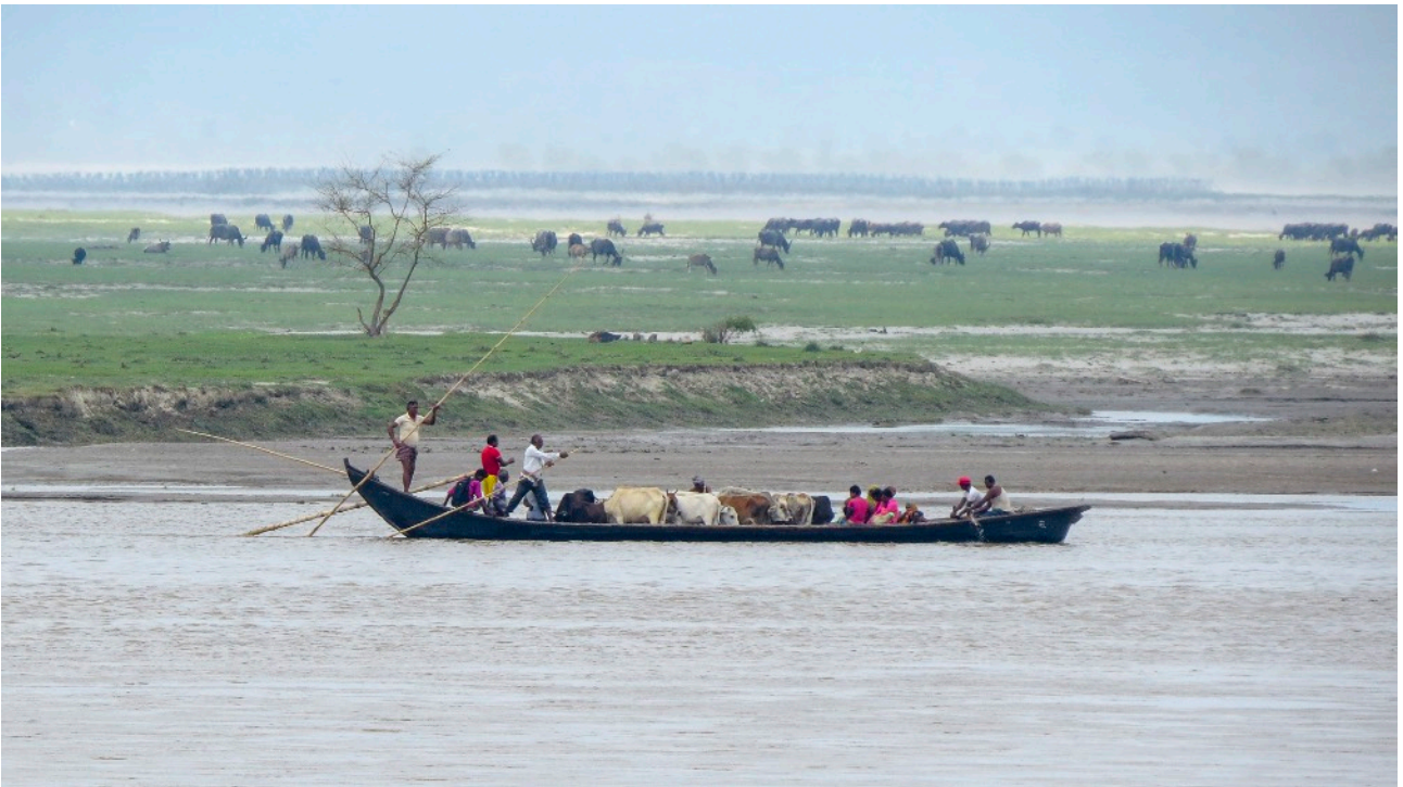
Traditional river transport carrying people and cattle, Kosi River.

For session wise updates, go to: indiariversforum.org/indiariversweek2022