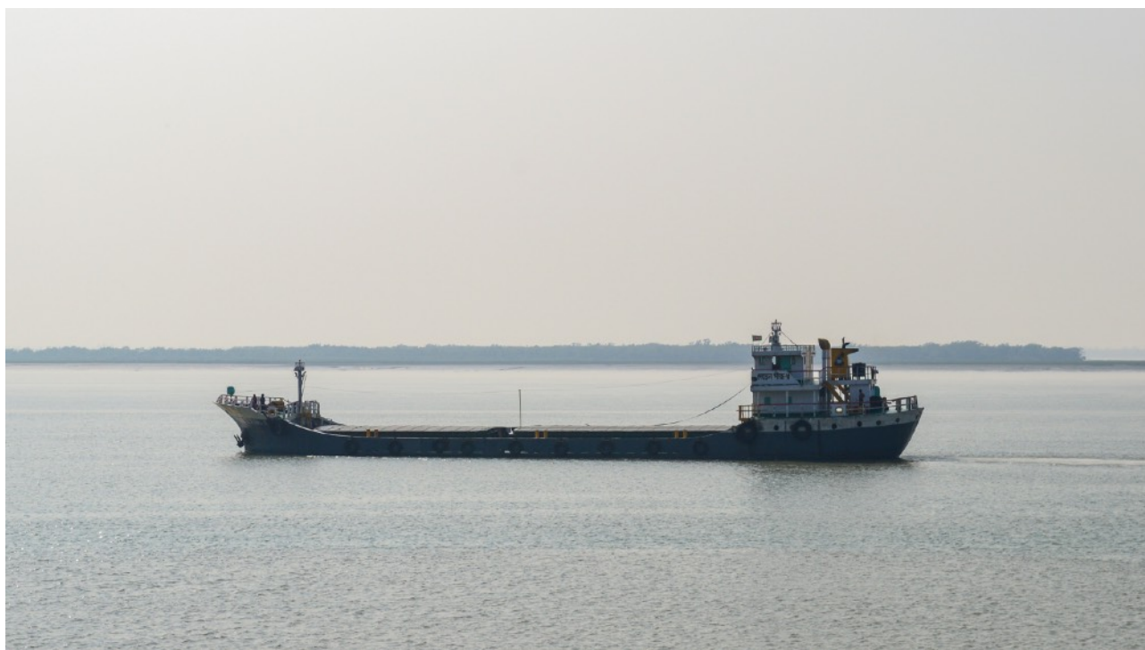
Fly ash barge in Namkhana, Sundarban.