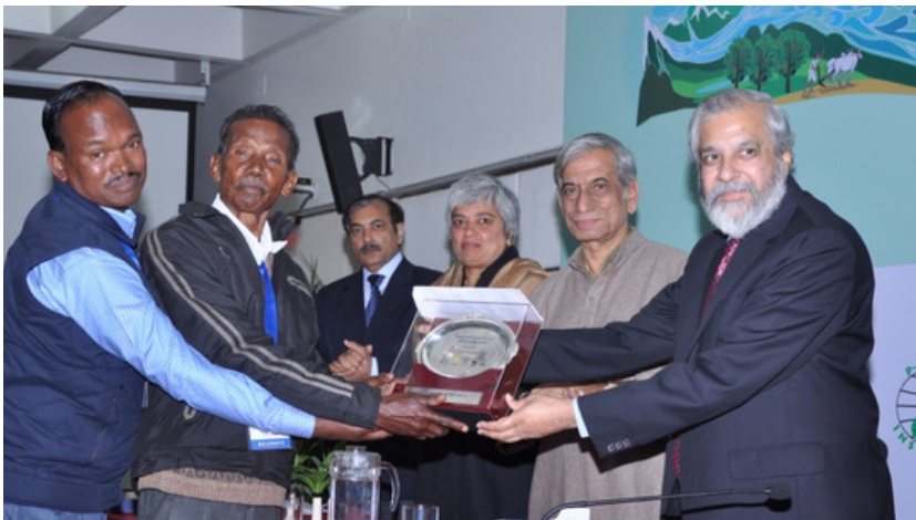
KOEL KARO JAN SANGATHAN, JHARKHAND

For combining sound research with community mobilization along with State agencies to safeguard the integrity of River Chalakudy in Kerala