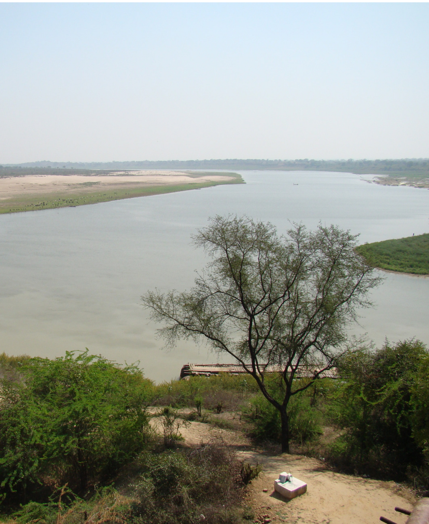
Front Cover photo (c) WWF-India Back Cover photo (c) Manoj Mishra / Peace Institute